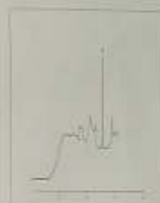
Chromatogram of urine sample. 1: styrene